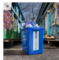
Machinery problems and a weak market for plastic bags has prompted Ecomaine to ask Waterville residents to stop putting recyclables in plastic bags.

Ecomaine says it will no longer accept the bags because they clog up the so machines at ecomaine's recycling facility in Portland, forcing workers to st process several times a day to unclog them. Also, the market for selling the very weak and ecomaine wants to encourage people to avoid using plastic l instead use reusable bags, said Lisa Wolff, ecomaine's communications m