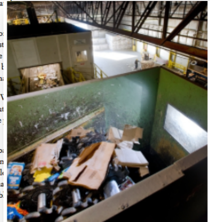
Sorting machinery is seen in operation at ecomaine, which is the company Waterville contracts with to dispose of its recyclables. The company says it will no longer accept plastic retail and grocery bags because the items clog up the sorting machines at its recycling facility in Portland.

Many supermarkets and other stores will a plastic retail and grocery bags at recycling s